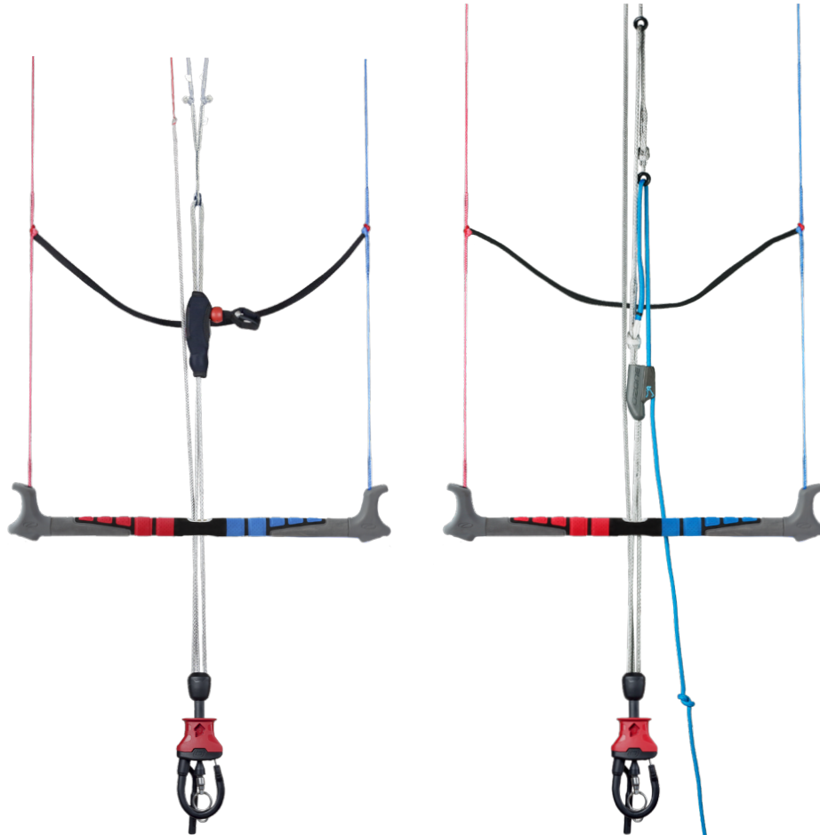
CONTACT SNOW *